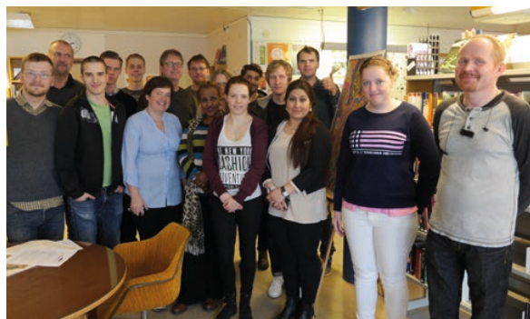
Hello! Internet is for everyone!

"We informed senior citizens via the Seniornet Skutskär/Älvkarleby, the National Pensioners' Organisation (PRO) and Swedish Pensioners' Association (SPF); we informed newcomers to Sweden via the Swedish for Immigrants (SFI) programme and the municipal integration unit; we informed people on the fringes of