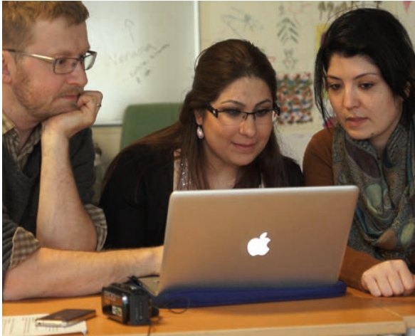
Video-editing time at Ljungskile Folkhögskola