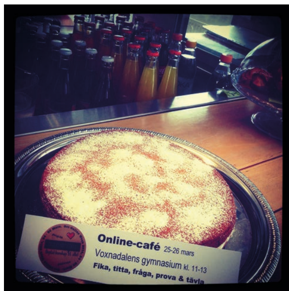
Online-cake at the Online Café.

Mjölby public library's main initiative on Saturday was an event we called Digital Saturday for Children. The day's programme included digital storytelling, TV games, and children's activities on the tablet computer. The event attracted many children and parents