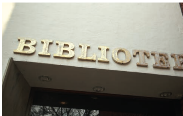
Get Online in the libraries! :)

"I had no idea it was so simple to make changes to the articles, for better or worse."