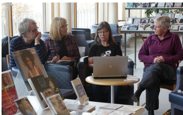
"There are 90,000 songs to pick and choose from!" (Västerås city library)

Another highlight of the week was the Wikipedia writing workshop on Wednesday evening which followed a short lecture about the encyclopaedia and why and how you should invest time in helping others make their own contributions. The participants were encouraged to discover it on their own. The group of seven which turned up was very enthusiastic and there was a long discussion about Wikipedia, co-creation and the Internet in general. Many ideas were hatched and the article about Mjölby and birdwatching was improved through a joint effort. The event led one woman to comment on the insight about the fleeting nature of Wikipedia: