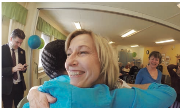
Laughter and joy at Brolyckan