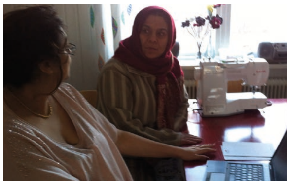
Learning how to access to internet bank

The week gave rise to many moments of joy and laughter. One of the most exciting aspects was the wide range of nationalities that visited us. Visitors all the way from America and South Africa, for example,