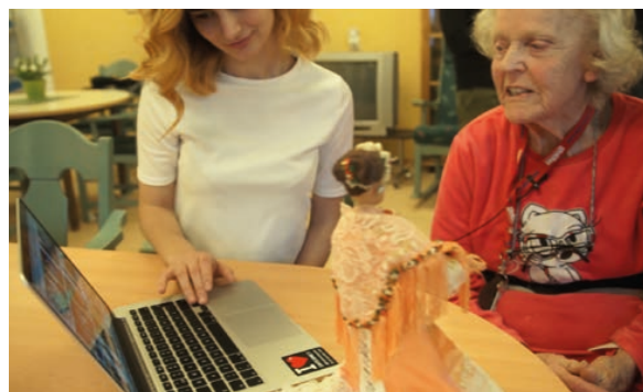
Finding pictures of dolls

On Thursday there was an introduction to health-related e-services. The County Council began with an introduction to how to use the online personalised health care service "mina vårdkontakter" ("my health care contacts"). You can, among other things, book a doctor's appointment and renew a prescription. The Social Insurance Agency demonstrated its e-services that you can use to conveniently contact the agency to get help with filling out forms and sending them directly and for reporting leave of absence to care for sick children. To round off, Apoteket AB, which is currently the only Swedish chemist which sells pre-