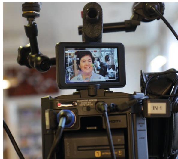
Get Online Week movie - in the making!

"Events like there are a source of inspiration. Although we only organised one video editing class, it inspired people and gave them the knowledge to continue doing it. You can use as much film as you like in the class. I hope that word spreads and that those who were here continue to spread the knowledge about how to use it."