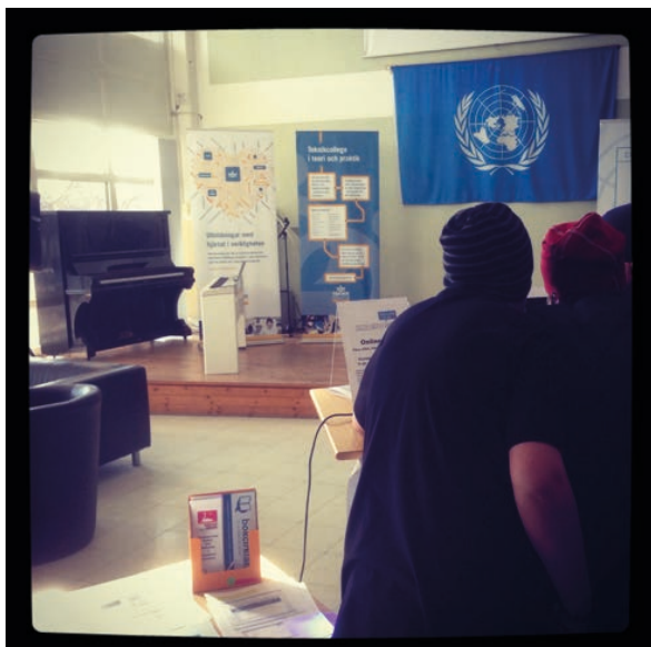
Youth learning more about internet

who we got to know. Language can sometimes pose a problem, but we had a visitor from Morocco who interpreted in French to a couple from South Africa, so there is always solution to every problem.