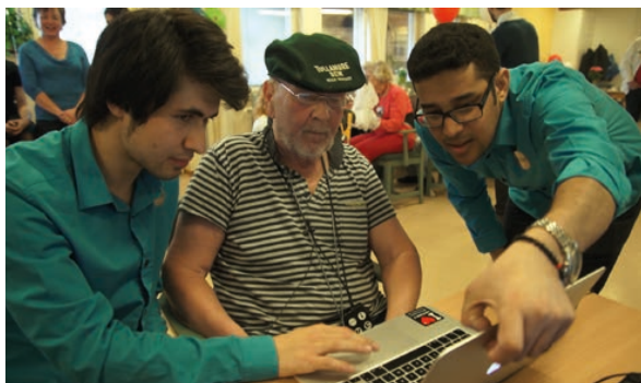
Searching and listening at music together

scription medicines online, showed us how to order medicines and have them delivered in the post and get reminders when it is time to renew your subscription, so you never have to worry about running out.